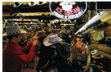
Clockwise from top left: Old Faithful. Million Dollar Cowboy Bar. Snake River Lodge & Spa. A hot-air balloon ride over the mountains. A cowboy-hat shop.