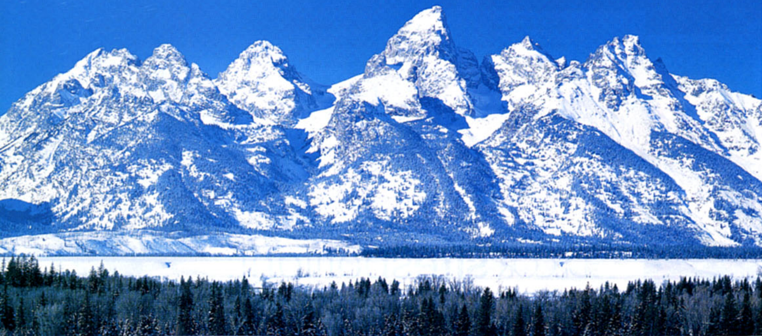
Grand Teton National Park in Jackson Hole.

Everyone seems headed for the mountains these days. But while Sun Valley has been deemed by some as too out of the way, Telluride as too trendy, and Vail as just too too, Jackson Hole, Wyoming, has been drawing A-listers and everyday folks alike for decades. More laid-back than its sisters to the East and West, this alpine valley offers a refuge from ordinary life in a breathtaking high-country setting of shimmering evergreens, majestic mountains, and crystal lakes and streams.