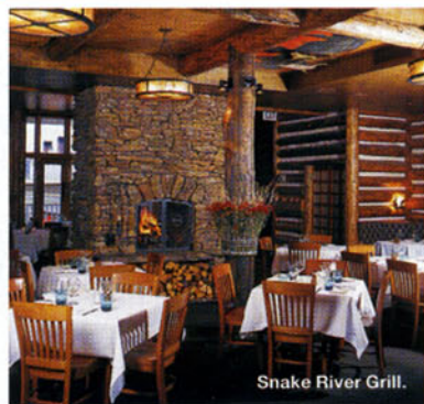
Snake River Grill.